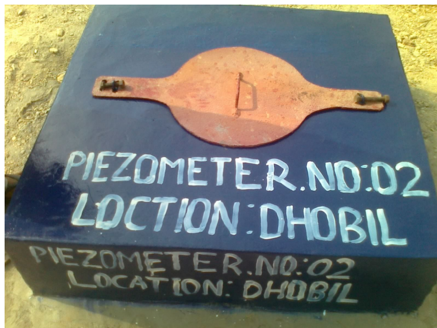
2. Piezometer at Dhobil Village