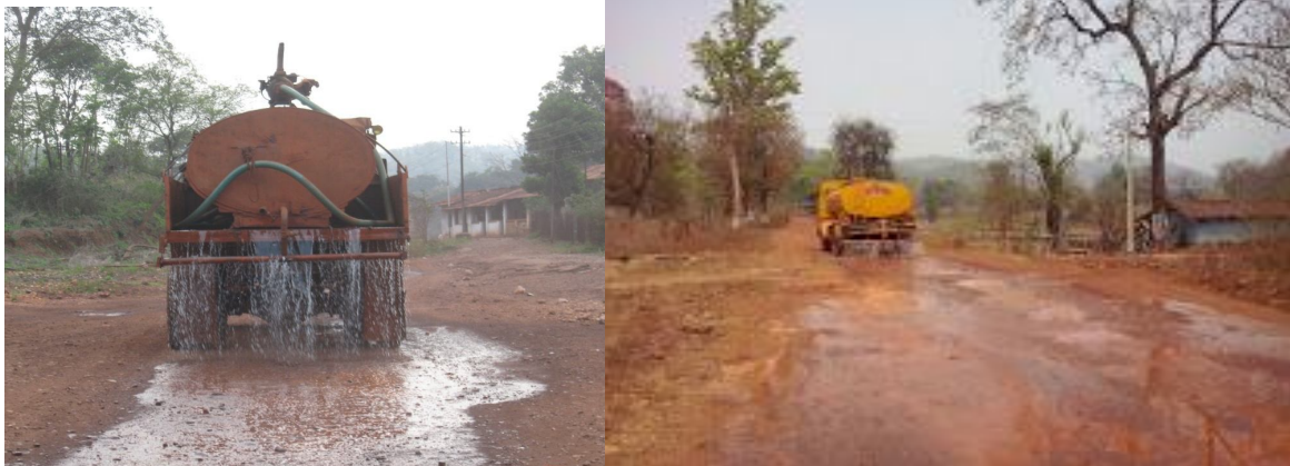
Water spraying on haul roads