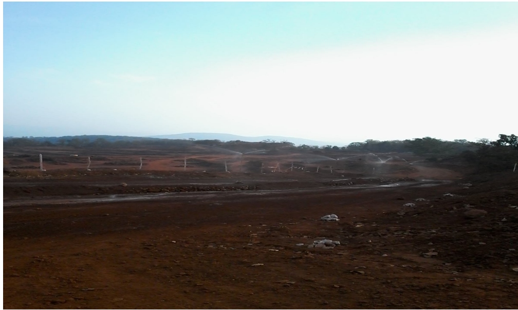
Fixed water sprayers have been provided on main haul road