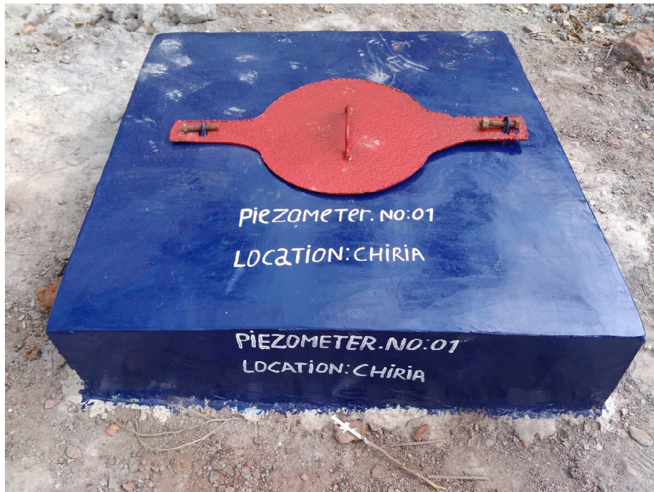
1. Piezometer at Dhobil Village