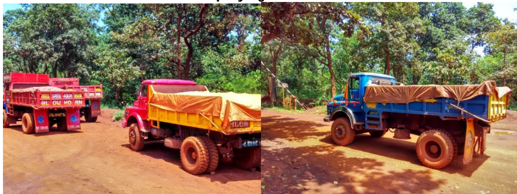
Trucks Covered with Tarpalin Sheet during transportation