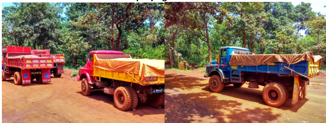
Trucks Covered with Tarpalin Sheet during transportation