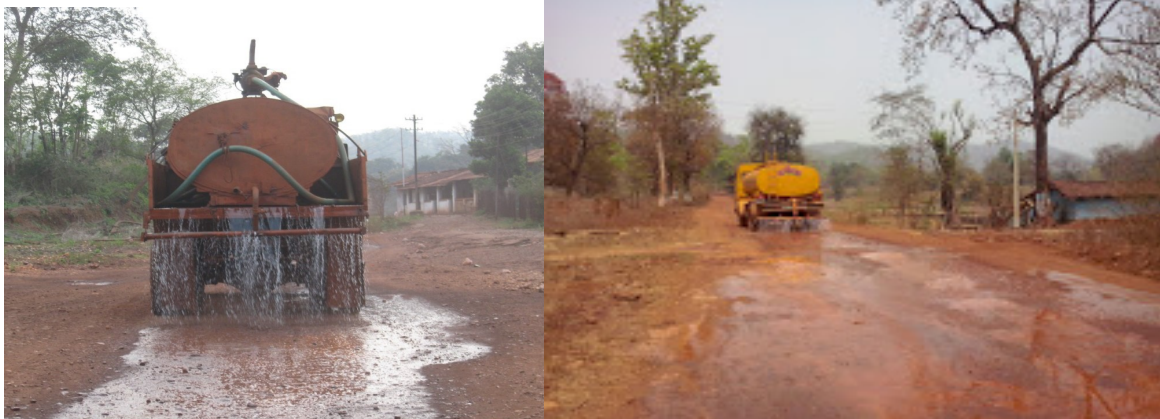
Water spraying on haul roads