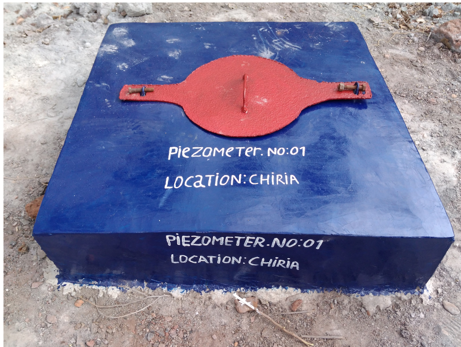
1. Piezometer at Chiria Village