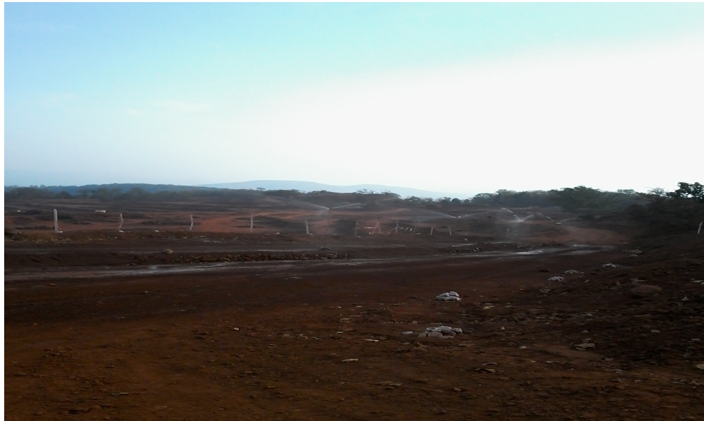
Fixed water sprayers have been provided on main haul road