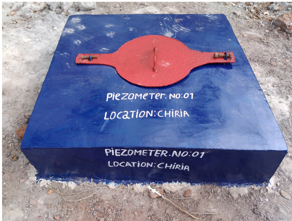
1. Piezometer at Chiria Village