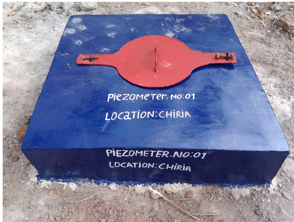
1. Piezometer No:1 at Chiria Village