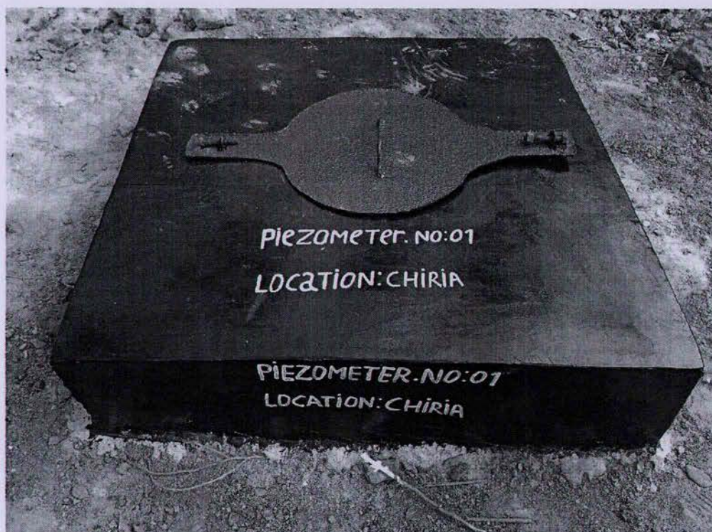
1. Piezometer at Chiria Village