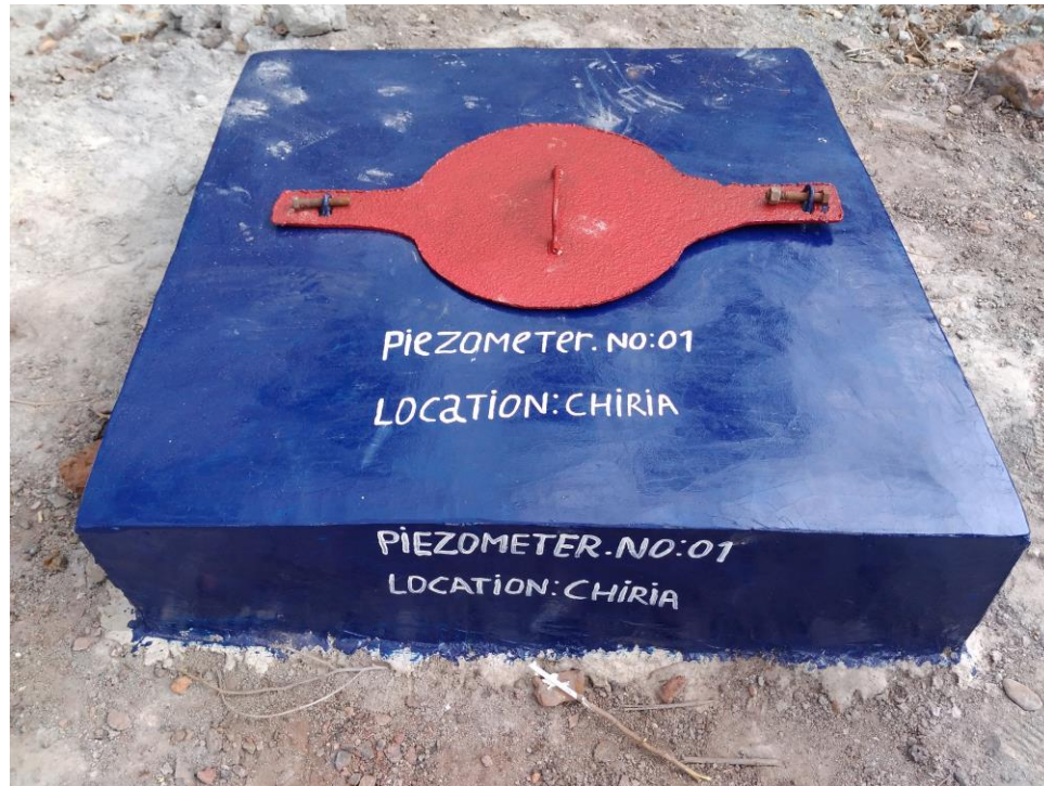
1. Piezometer at Chiria Village