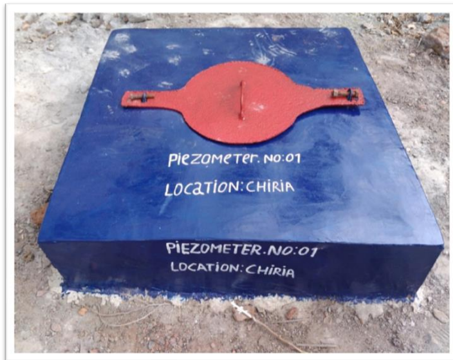
1. Piezometer at Chiria Village