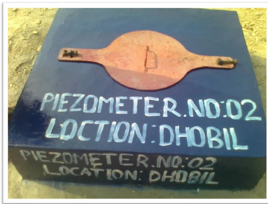
2. Piezometer at Dhobil Village