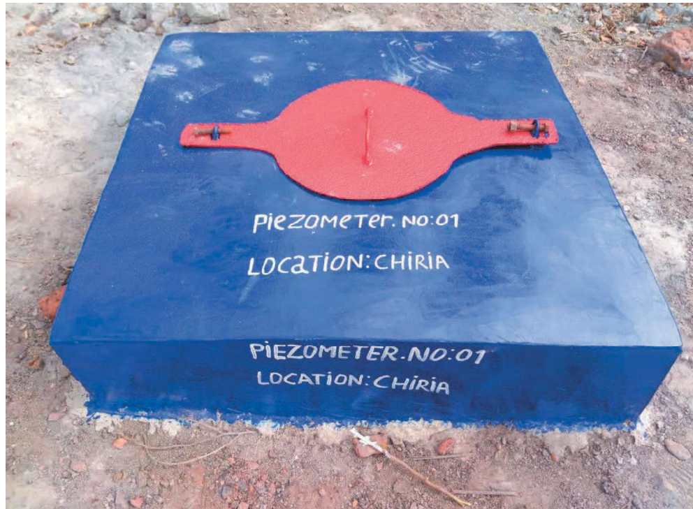
1. Piezometer at Chiria Village