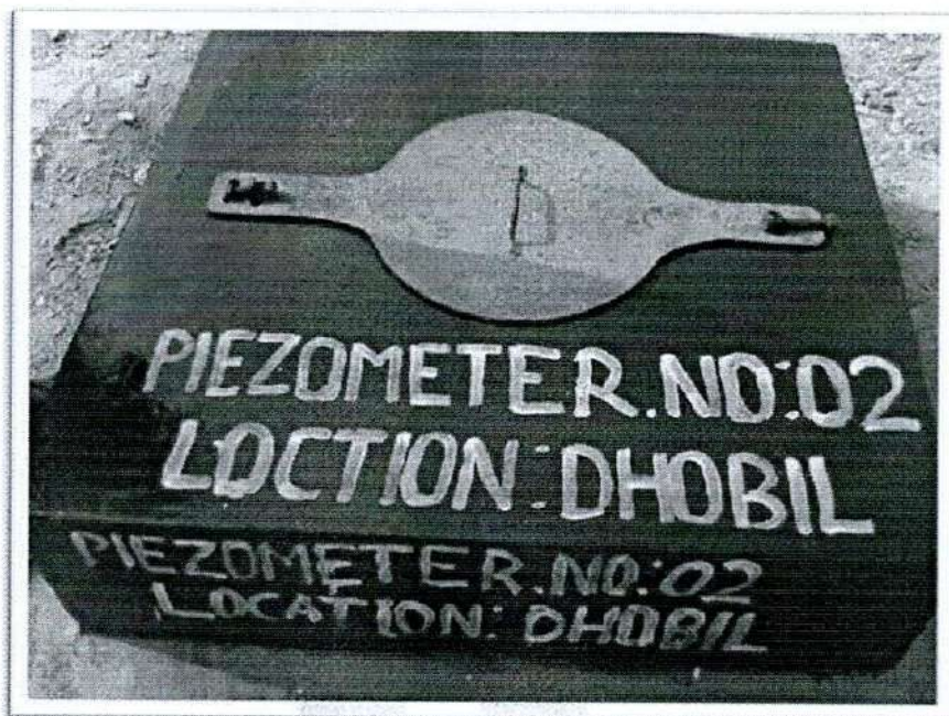
2. Piezometer at Dhobil Village