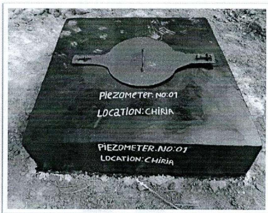
1. Piezometer at Chiria Village