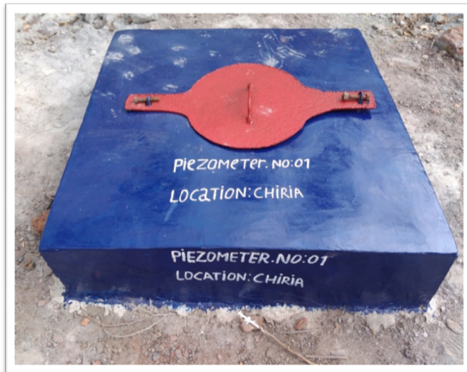
1. Piezometer at Chiria Village