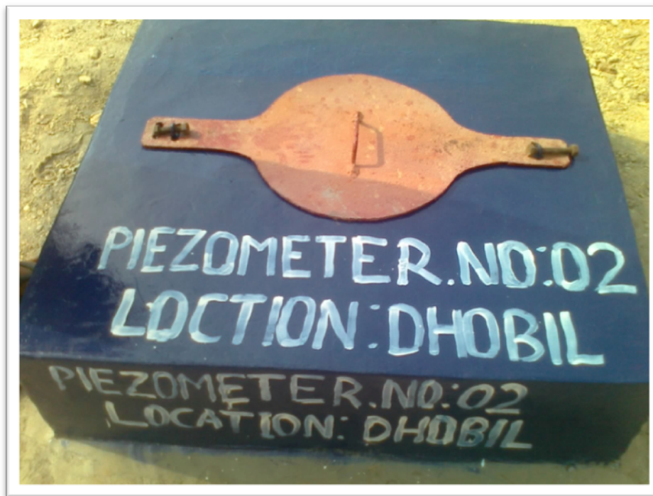
2. Piezometer at Dhobil Village